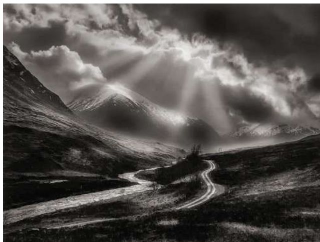
Light Thro' The Glen, Roy Essery MPAGB, C29 Small Prints