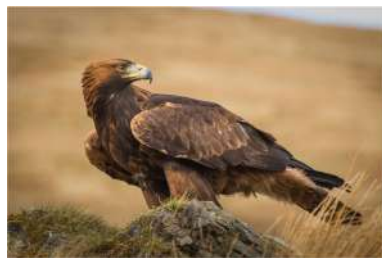
Golden Eagle by James Finnigan—C60