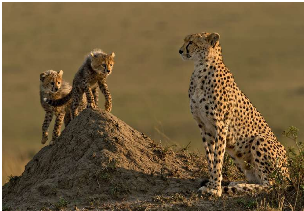
Cheetah and Cub, Ian Whiston DPAGB EFIAP BPE5*,C31/33/35 Projected Image