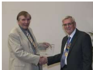
Winner of the Peoples Choice Award